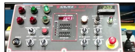
Ergonomic Operator's Control with Joystick and RPC