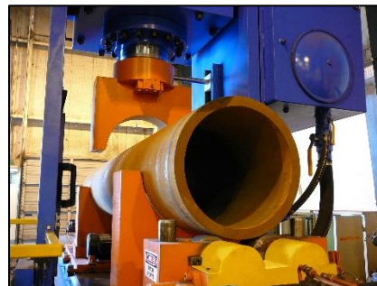
18" Diameter Tube in U-Blocks