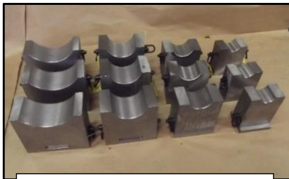
Quick-Change U-Blocks 5" – 12" Diameters Shown