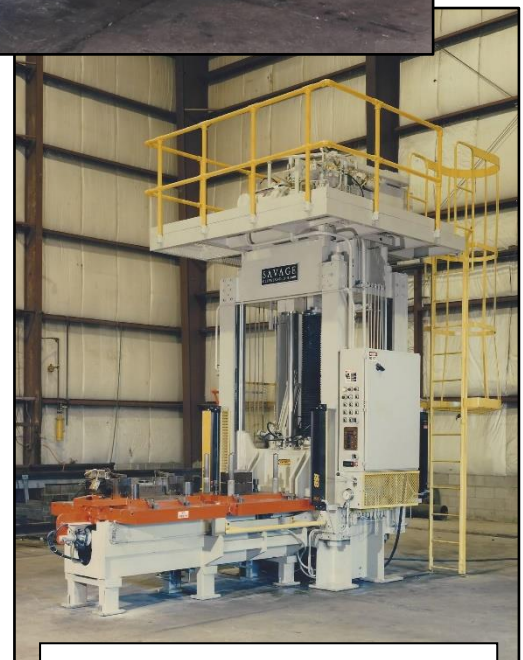
Shown in 180° inverted mode