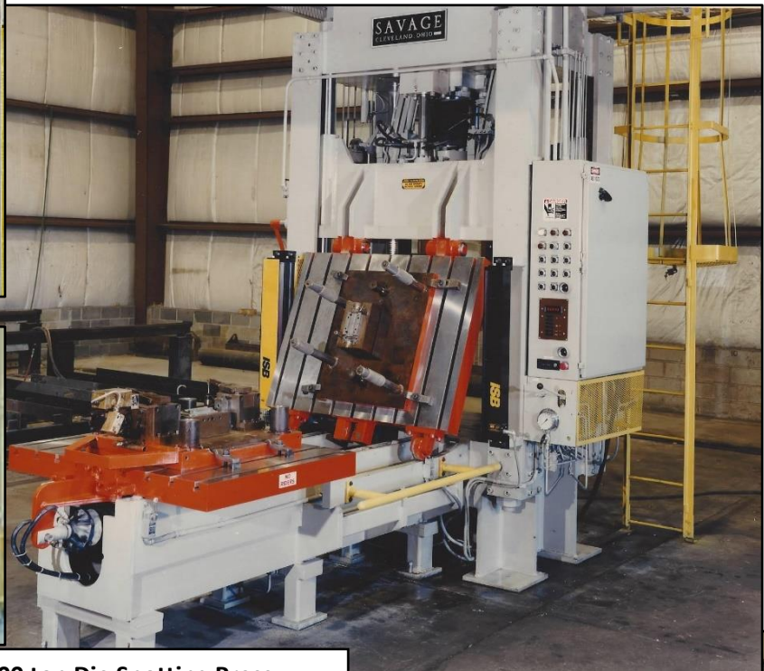
100 ton Die Spotting Press Shown during platen inversion

This elegant solution to outdated spotting methods saves time and increases production.