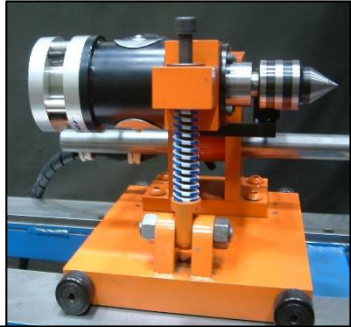
Optional Air-Clamp Centers* for Workpiece Stabilization

Customer-Specified: Tonnage Bed Length Cylinder Stroke Daylight Opening Speeds Custom Options