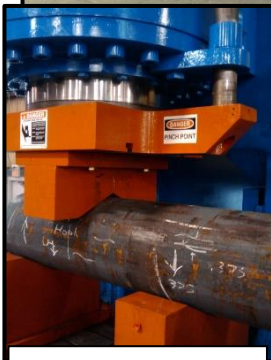
750 ton Model