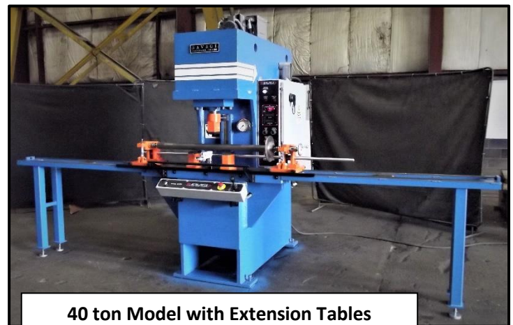
40 ton Model with Extension Tables and Straightening Accessories