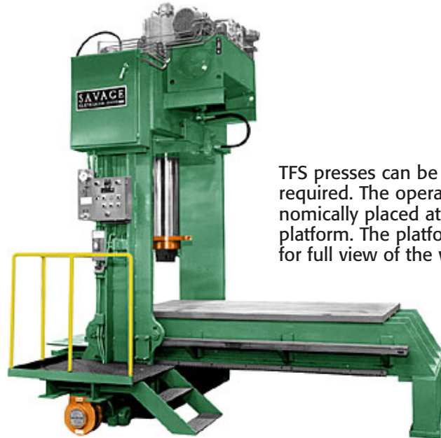
400 Ton Model

Straightening/Bending fixtures, risers and plate lifters are available.