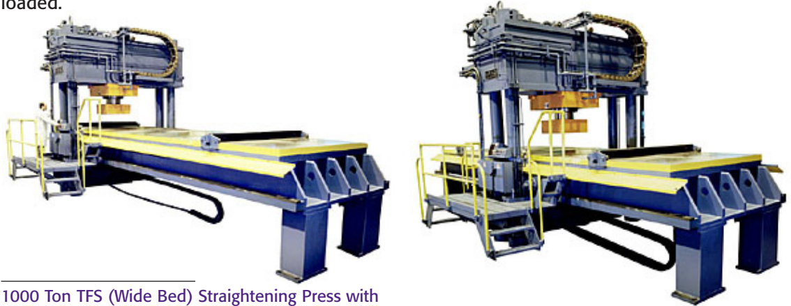
1000 Ton TFS (Wide Bed) Straightening Press with 120" wide x 360" long bed.

Available in practically any bed size, all are rigid enough to for full tonnage across the entire bed. Presses can weigh up to 1/2 million lbs. The 3 axes of movement allow the ram to cover any point along the bed so that work does not have to be moved after it has been crane loaded.