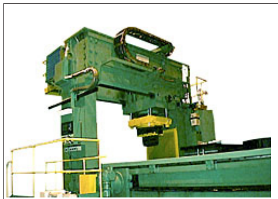
1100 Ton TFS Press with 118" x 236" bed

This plate straightening press can handle plate up to 7" thick, 120" wide and nearly any length. Multiple hydraulic plate lifters are available provided flush with the bed to allow the pressing anvils to be relocated under the workpiece without the use of an overhead crane.