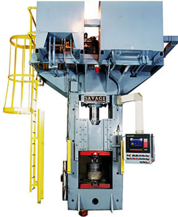
400 Ton Hot Extrusion Press to preform alloy steel prior to forging.

These housing type SS presses feature pre-stressed tension rods through the side housing uprights, connecting the crown to the base for a very rigid frame. Prestressed tension rods prevent frame stretch to compensate for break-through shock. For severe duty applications: blanking, punching, piercing, hot extrusion, perforating & forging. Also used when multiple dies are used creating off-set loading. Adjustable gibbing allows a tight running clearance.