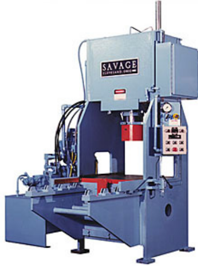
300 Ton Slab Side Flattening Press with Sliding Bed

Available in 4 post or slab side construction, these shuttle bed presses allow crane loading of heavy parts and promote safety since the operators hands do not enter under the ram. Presses can be used with dies or fixtures for assembly operations, straightening, cutting or compacting and many other applications.