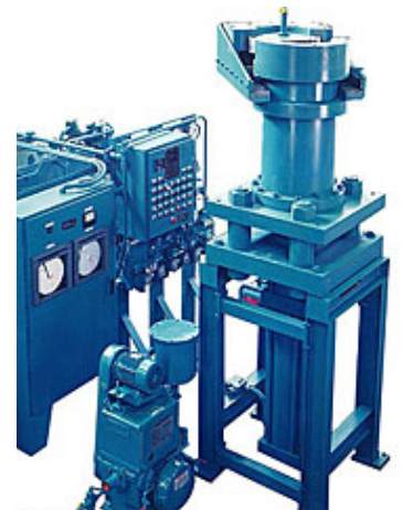
200 Ton Model Blocking Press

Features opposed guided platens with adjustable center tool holder. Positive stops for depth control. Remote operation for explosive powders. Computer controlled programmable functions.