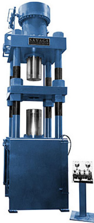
600/600 Ton Model

Savage explosives compaction presses are designed per your product requirements. These presses compact explosive powder billets or shape charges, pyrotechnics, flares, munitions, countermeasures, etc. We build presses with single or opposed compaction rams, ejectors, and compaction tools to meet your needs. Opposed ram presses allow compaction from both ends of the tool cavity for a more even density on thick parts. Programs are also available to compact with either the upacting or downacting mode with the opposing ram used in a fixed position. Local or remote mounted hydraulics. Available rated for hazardous locations by using either air shift valving or intrinsically safe components. Local electrical components are mounted in either air purged NEMA 12 or explosion proof NEMA 7 cast enclosures to meet hazardous location ratings. Remote mounted computer storage of setpoint programs for programmable speeds, pressures, dwell times, vacuum, tool temperatures, and quantity of pressure applications. Available with tooling for compacting powders into munitions, warheads, countermeasures, and smart bombs.