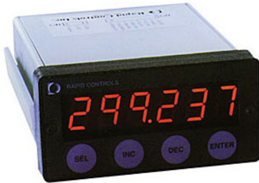
Ram Position Display

The Savage RPC measures displays and controls ram stroke or platen position to 3 decimal place accuracy. The RPC is excellent for straightening, forming, diespotting, assembly or any application requiring precise ram position control. It is also used as a programmable limit switch, even on applications which do not require position control.