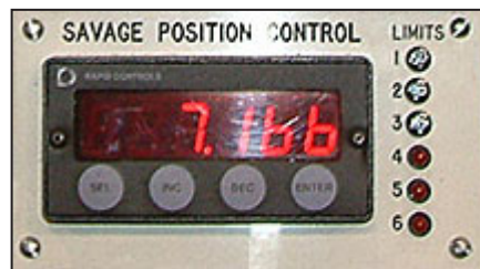
RPC Ram Position Control