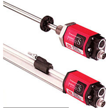
MTS Temposonics SSI Sensor